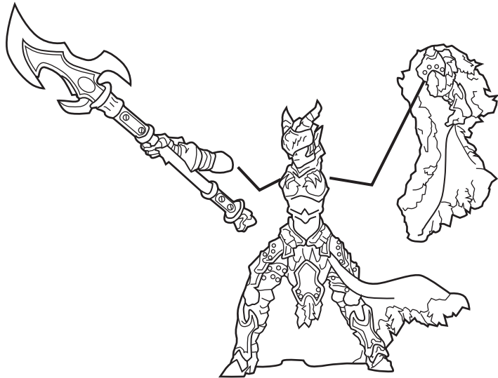
KRYSSA, CONVICTION OF EVERBLIGHT WARLOCK